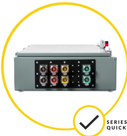
SERIES 16 QUICK CONNECT